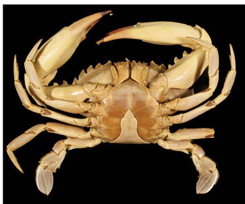
Figure 2. Ventral view.