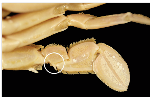
Figure 6. 5 th left pereopod of C. hellerii (ventral view) - inside the circle the strong, pointed spine of the carpus.