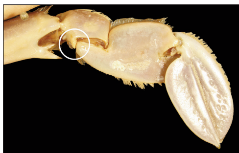
Figure 5. 5 th left pereopod of C. lucifera (ventral view).

As far as we know today, the finding of this single specimen represents a single, isolated case. The large dimension and the very unusual shape makes us think that the species has not so far acclimatized in our waters.