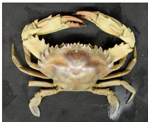
Figure 1. Dorsal view.