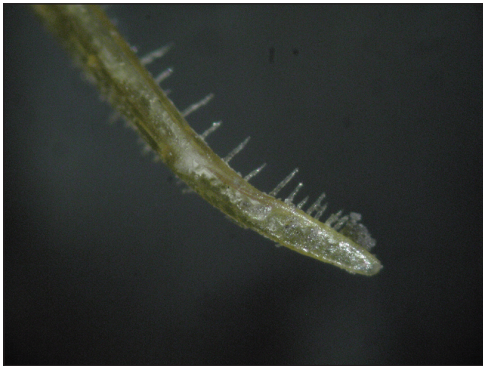
Figure 3. First right pleopod (apex).

The colour of the specimen was not detectable at the moment of our examination, due to its conservation in alcoholic solution. Only four spots were still visible on the branchial region, the two nearer to the cardiac region larger than the two nearer to the posterolateral region. The tips of the spines of the chelipeds and the anterolateral teeth appeared reddish-brown.