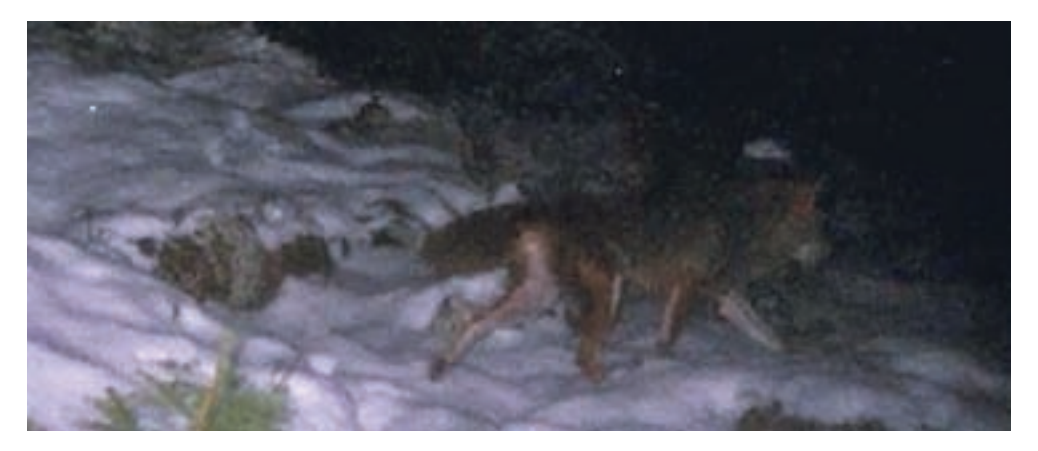
Fig. 4. A male golden jackal photo-trapped in February 2006 near Bovec (north-western Slovenia) (Photo P. Molinari).

Photo trapping. Photo-traps were particularly useful to ascertain the identity of a jackal near Bovec (northern Slovenia, fig. 4) and that of some howling specimens in the Community of Pulfero (Udine, Italy). The utilisation of baited photo-traps has also permitted to verify the reproduction of the golden jackal near one howling-spot localized on Julian Pre-Alps. In September 2007, in fact, it was possible to obtain a portrait of a young golden jackal that seemed to be 5-7 months old. Its photo was submitted to various jackal experts, included Giorgios Giannatos (University of Athens), who has confirmed that the specimen was a young, surely born in the surroundings of the monitored howling-spot.