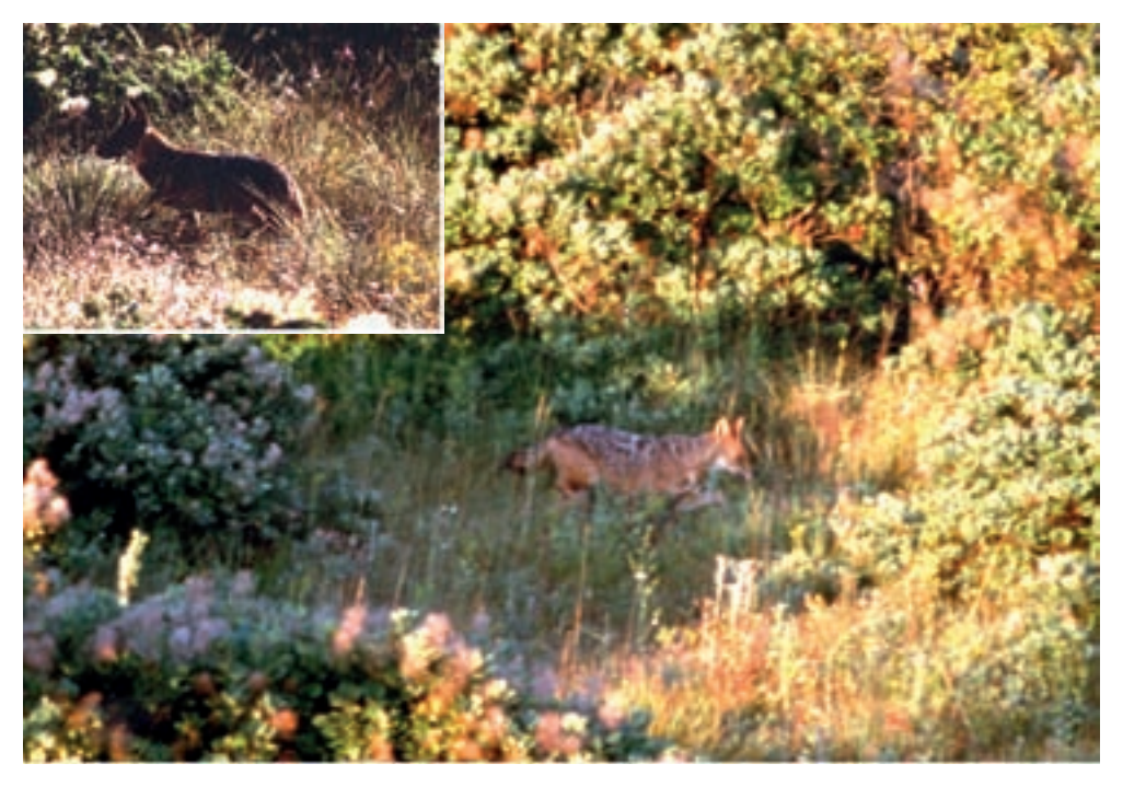
Fig. 3. Two golden jackals photographed in the polje of the Lake of Doberdò (Community of Doberdò del Lago, Gorizia, July 1997) (Photo A. Scarpa).