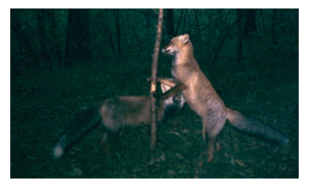
Fig. 5. Two red foxes photo-trapped by a deer-cam during the olfactory-exploration of a plant baited with n-Hexanoid Acid. The attractant was sprayed on a little cortical incision practiced on the small tree (10 September 2006, loc. Comesta, Tramonti di sopra, Pordenone).

The study and dissection of dead animals was performed on a single sub-adult male killed by cars. It was collected on 25 February 2009 along a highway near to the village of Sistiana (Duino-Aurisina Community, Trieste Province) by agents of the Italian Forestry