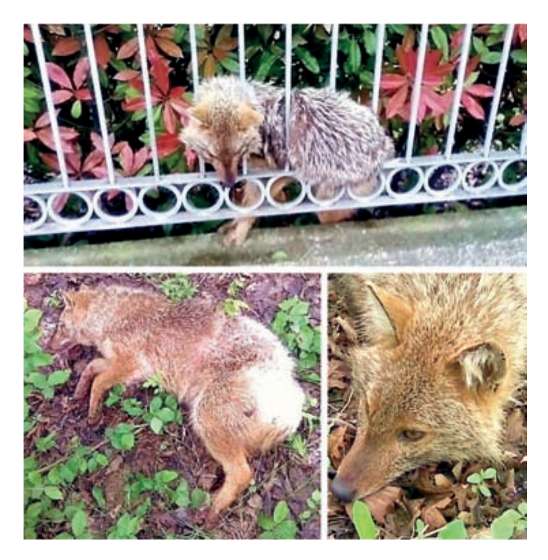
Fig. 7. A sub-adult male without the tail caught in the centre of San Dona' di Piave (Province of Venice) on the 30<sup>th</sup> April 2009. The specimen it was found entangled in a metallic fence in the city (above: photo P. Serafin). It was rescued following a bland anaesthesia (below, on left: photo M. Cappelletto) and then released in the wild, within a protected area near San Stino di Livenza (Province of Venice) (below, on right: photo M. Cappelletto).