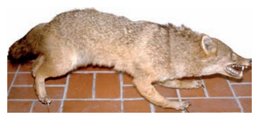
Fig. 1. Male golden jackal shot in the wood of Razor (Vrhnika, Ljubljana) in January-February of the 1953 (Unlabelled specimen from the Museum of Bistra, Ljubljana). The data of this specimen, together with various sightings from Julian Pre-Alps, were firstly published by Savo BRELIH (1953).