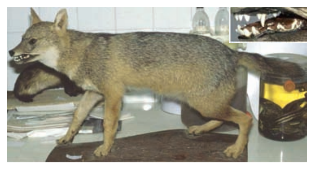
Fig. 2. A five to seven months old golden jackal born in the wild and shot in the surroundings of Udine, north-eastern Italy, in September 1985. Note that the specimen was at the end of the milk dentition, showing the double canine tooth-pattern typical of this age. This is probably the first golden jackal reproductive data available from north-eastern Italy (LAPINI & PERCO, 1988, 1989).