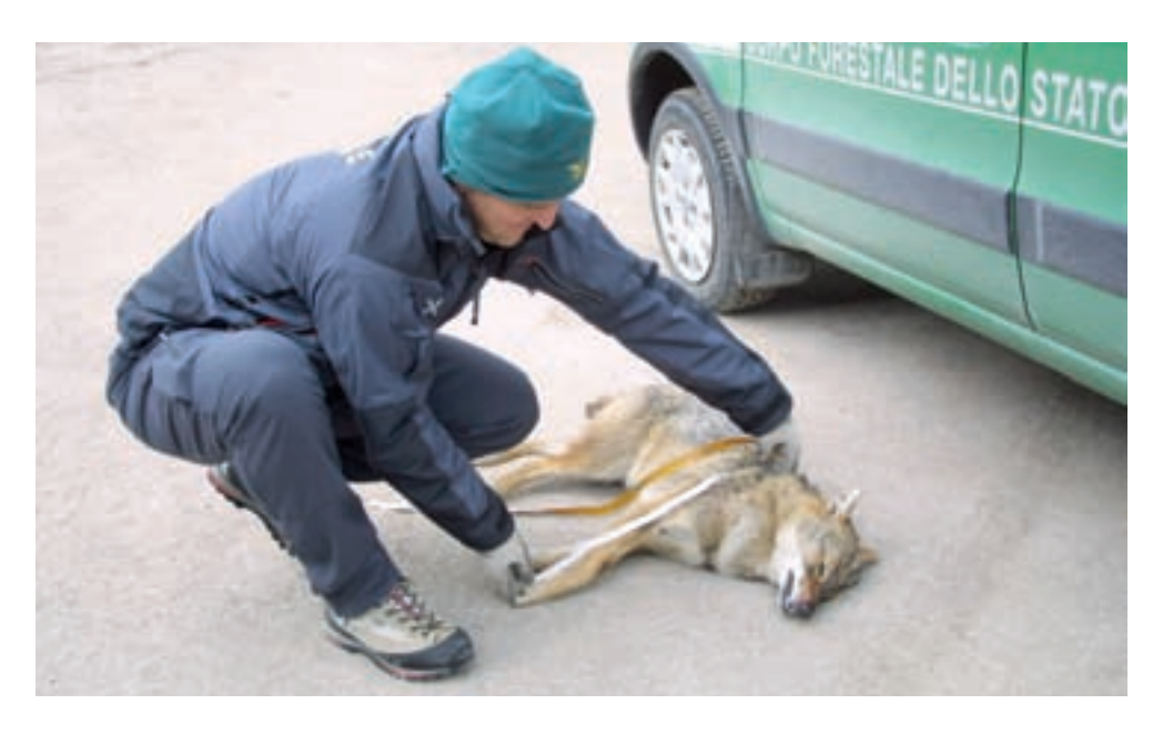
Fig. 6. A sub-adult male about two years old road-killed in the surroundings of Sistiana (Duino-Aurisina Community, Trieste, north-eastern Italy) on the 25<sup>th</sup> february 2009 (Photo CFS, Territorial Office for the Biodiversity from Tarvisio, Udine).